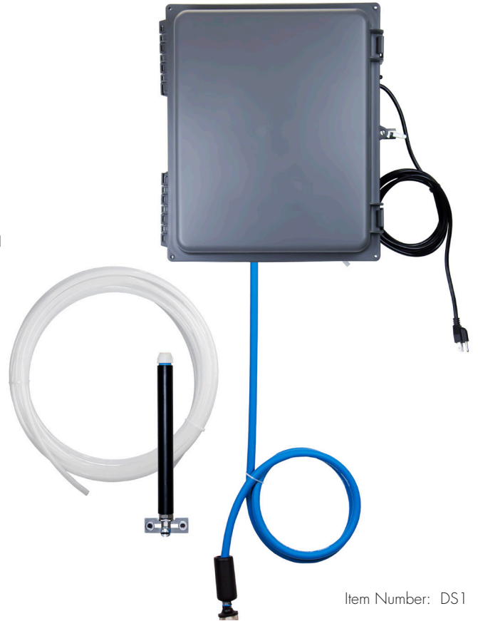
Item Number: DS1